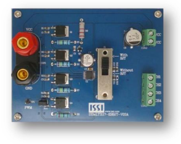
Fig 3 Non-BJT IS31LT3117 Eval Board